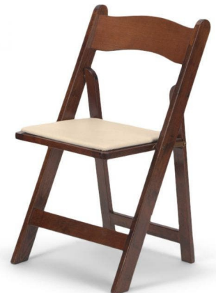
Matching Wood Stained Chairs $10/each