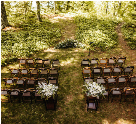
Vintage Wood Folding Chairs $10/each