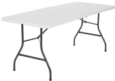
6' Folding Table (4) $20/each Linens available in rental shop