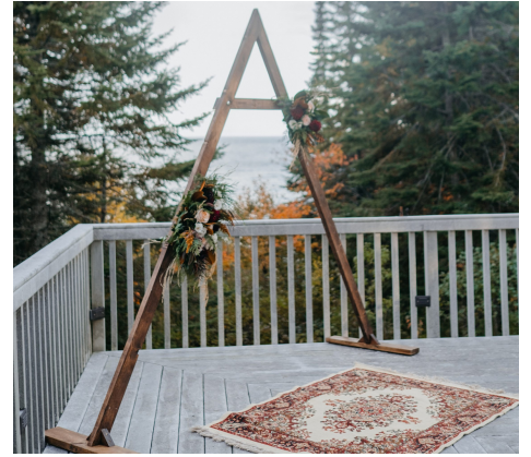
Triangle Arch $150 Drapery + flowers extra