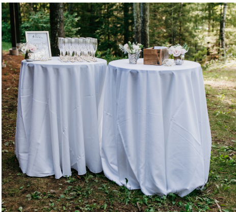
Cocktail Tables (7) $15/each Linens available in rental shop