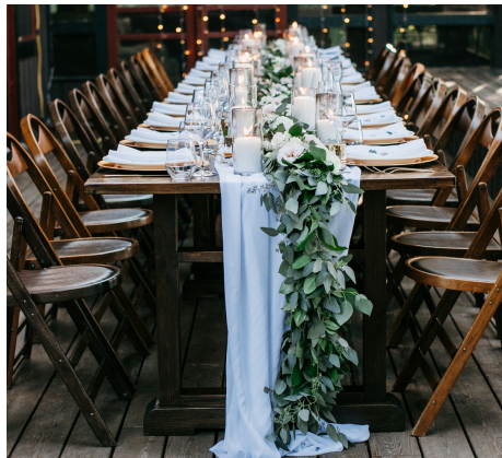
Farm Tables - 4 Available $125/each