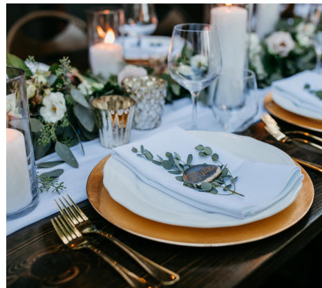
Plates, Silverware, Glassware, Chargers, Decor - See our rental store on our website!