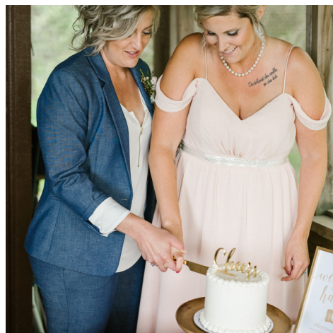
Kellie Rae Studio