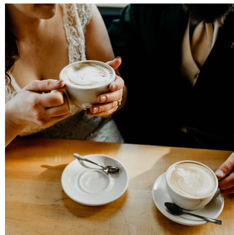
Autumn Dog Studio