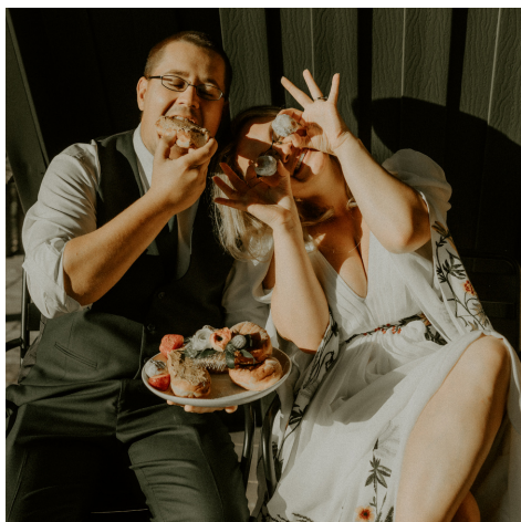
Copper Antler Weddings